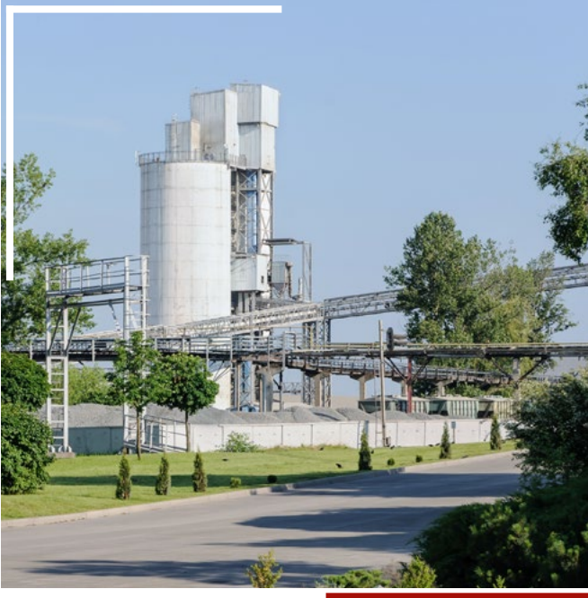
Terminal design and construction for the cement and building material industry.

Operational Management // Maintenance Improvements // Plant Optimisation